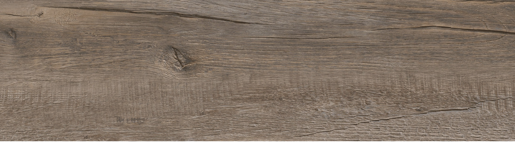
Ash – P308-LL