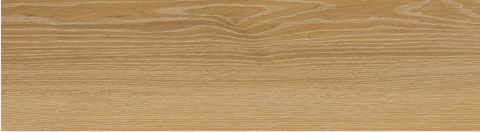
Acadia – P307-LL