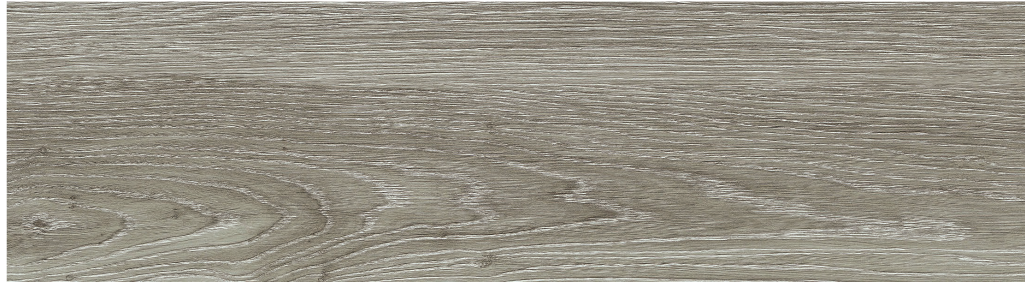
Fossil Gray – P303-LL