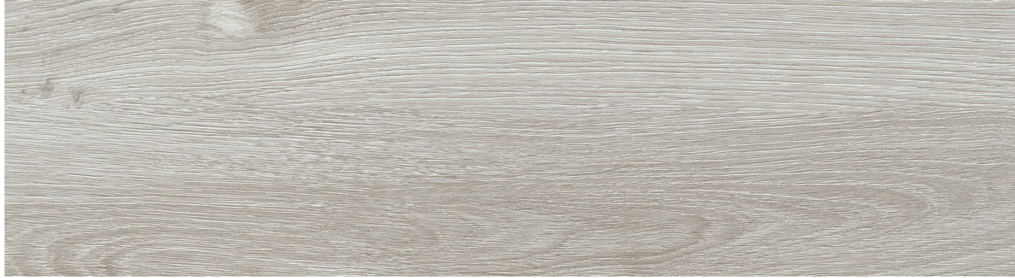
Oyster – P301-LL