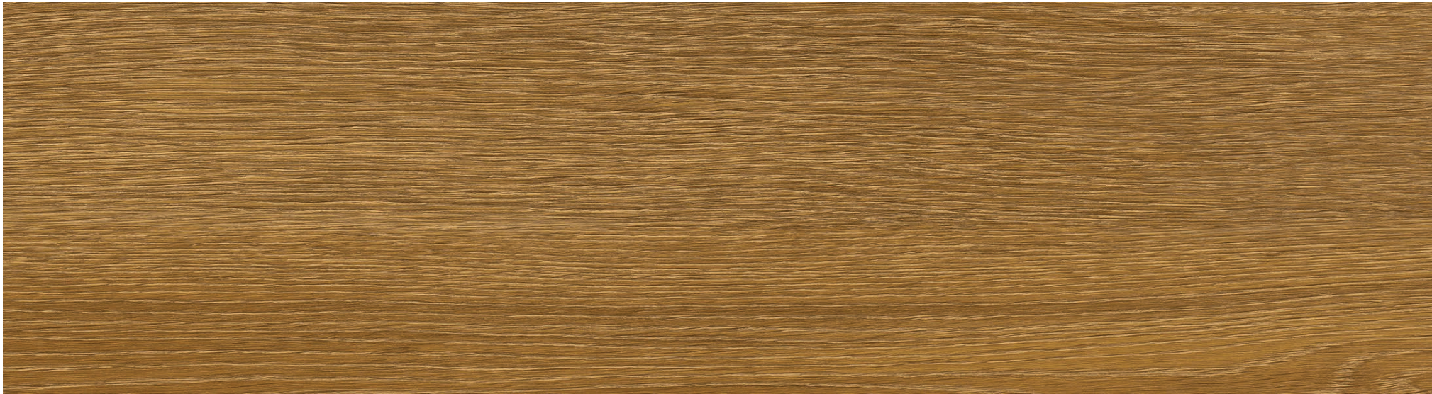
Winchester – P305-LL