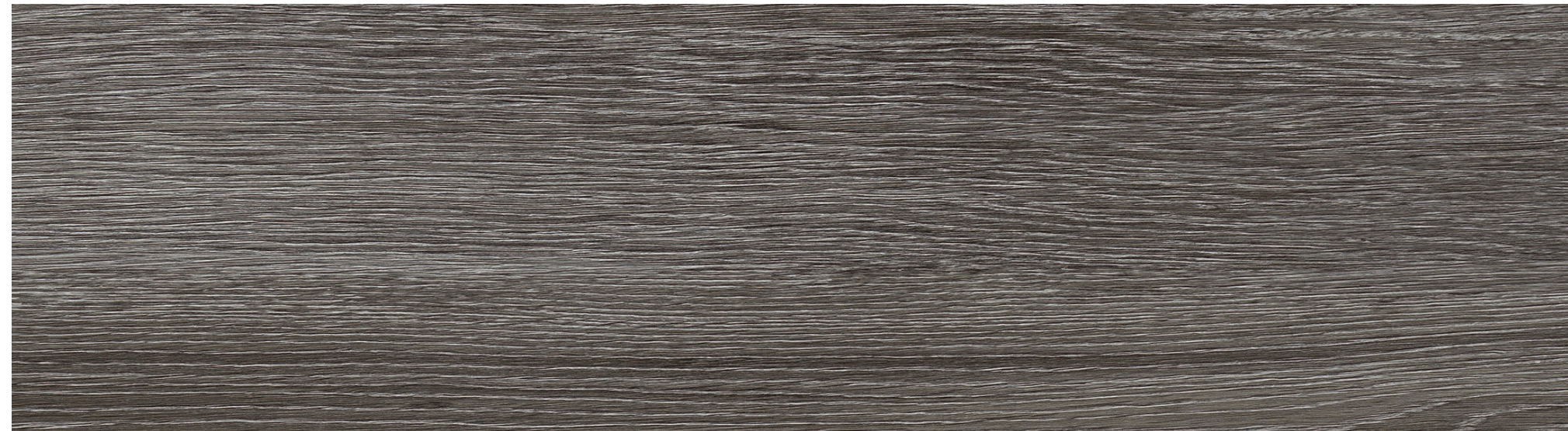
Plantation – P306-LL