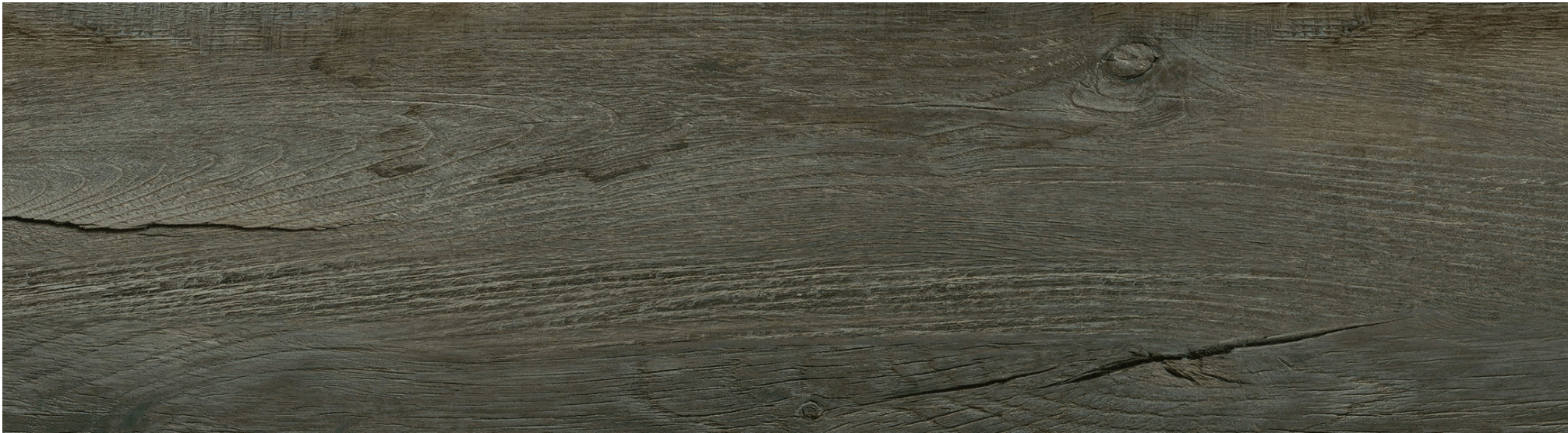
Stonehenge – P302-LL