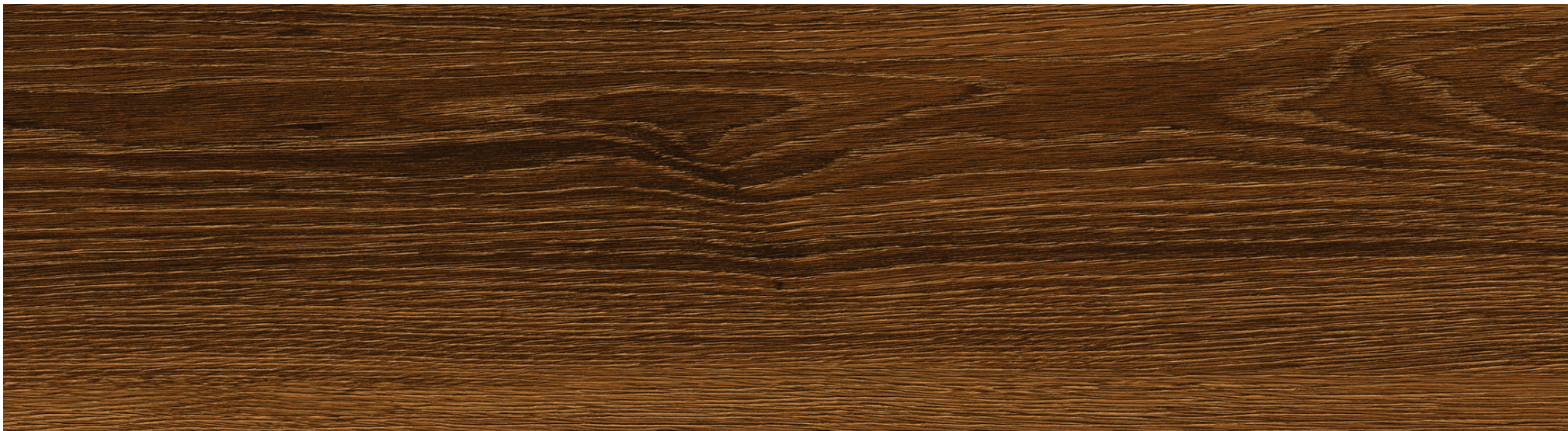
Arbor – P304-LL